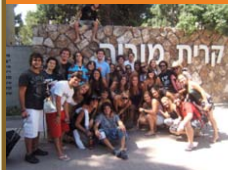
Some of the 2009 SHnat MAROM participants from AMLAT

2009 has been a very successful year for MAROM long-term programs in Israel, with a total of 50 participants arriving on programs from Argentina, Brazil, Chile and Uruguay at the start of the year. The program included leadership training at the Machon LeMadrichim, Jewish study, volunteering in development towns and for some a Holocaust themed trip to Poland. Masorti kehillah Bet El in Mexico was extremely successful in recruiting 26 participants for the Lech Lecha program which started in September 2009, and NOAM in the UK sent five people to its Drachim program. MAROM is expecting more than 75 participants from AMLAT on long-term Israel programs in 2010.