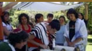
Camp Ramah Yachad, Ukraine