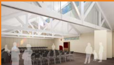
Architect's 3D model for the sanctuary

Kehillat Nitzan is constructing a multi-purpose synagogue building on land donated to them. The synagogue will accommodate up to 700 congregants, and will be ready for next Rosh Hashanah.