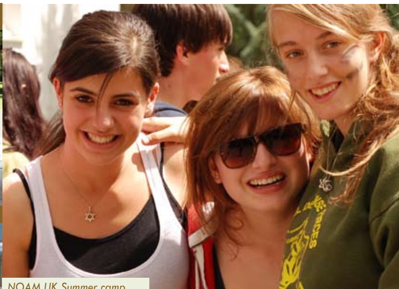
NOAM UK Summer camp