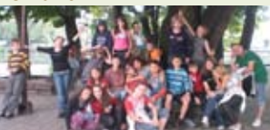
NOAM UK Israel Tour