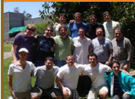
MAROM AMLAT seminar in Chile

MAROM AMLAT (Latin America) representatives from Argentina, Brazil, Chile and Uruguay met in Chile in the middle of November, 2009 for an intense 3 days leadership seminar.